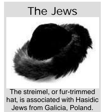
The streimel, or fur-trimmed hat, is associated with Hasidic Jews from Galicia, Poland.

Today the Ashkenazim are either Lithuanian or Hasidic. The Lithuanian (‘Vilnius’) Jews were the only group to hold out against the teachings of the Baal Shem Tov, being staunchly opposed to Hasidism, and are today known as Mitnagdim (‘opponents’). The Hasidic Jews are recognized by the names of the original home towns of their Rabbis. Politically these consider the modern Jewish state to be a human institution, not one ordained by God, and might walk out of their seats in the Knesset when the Hatikvah , the national anthem, is played.