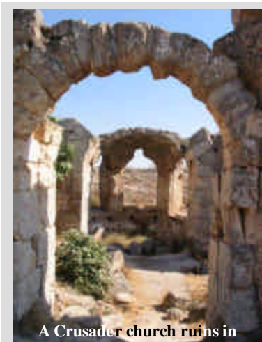
A Crusader church ruins in modern Antioch (Antakya)

(Herod's later temple would be larger in size than that of Solomon, and its surrounding walls correspond more or less to those of the 'Temple Mount' today).