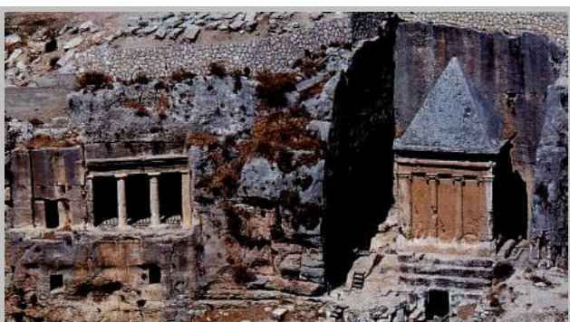
From the walls of Jerusalem, these Hasmonean tombs can be seen in the Kidron Valley.

This dynasty survived through various family conflicts, culminating in a civil