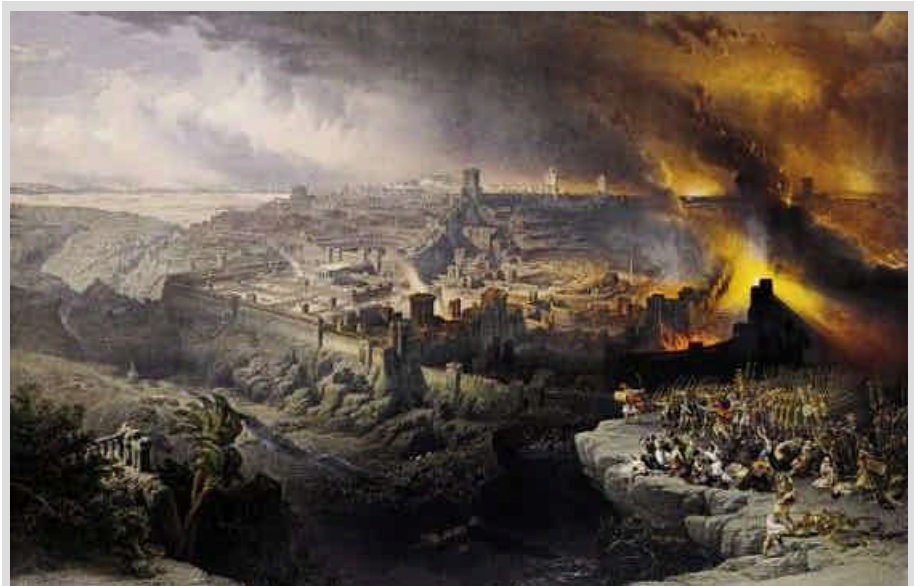
David Roberts' 19 th century pictures of the Holy Land are famous, but this one is less well known. It has been recently restored, and shows Jerusalem, apparently during May or June of AD 70, from the vantage point of the Tenth Legion on the Mount of Olives.

Josephus, from whose writings this account has been drawn, was recruited by Titus, in the hopes that he could effect the surrender of his people. This was in vain, but Josephus' account gives us a detailed, if self-aggrandizing account of the war, and valuable contemporary descriptions of first century Jerusalem.