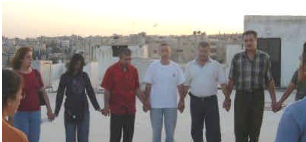
Church and School workers on the roof of the 'new' building they are praying for.

With the new building we would be able to double our enrollment, and we would have a playground, and room to breath! We rented a bus and went with the church leaders for prayer to the new building (see photo). Afterwards we took a poll and the church was unanimous in their support for the move. Please pray for us as we put together a plan for the fund raising. In September I will be meeting with key Jordanian leaders and, God willing, I will be coming to the States in October. I will be meeting and gathering advice and support from some of my "mentors", respected friends, and key supporters. Pray that God would guide, direct and open doors.