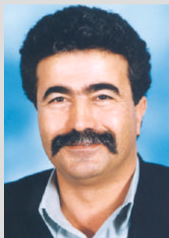
Amir (Armand) Peretz (b. 1952)

In 1999 Peretz split with Labour to found the Am Ehad, One Nation , political party (see e-NEWS issues 23, 24 & 32). This merged with Labour in summer of last year, 2004.